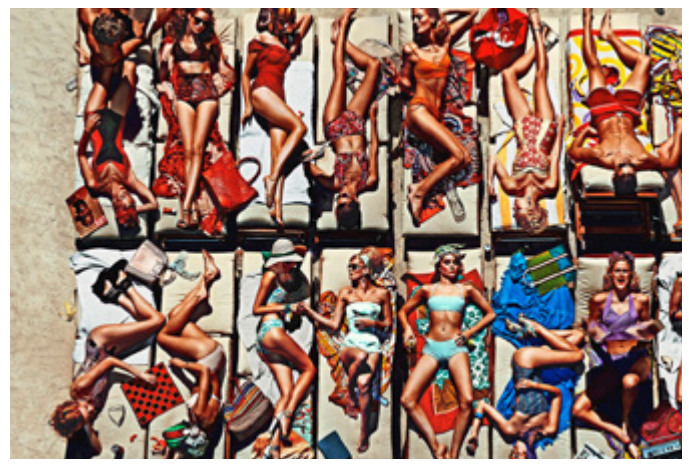
Flamingo Kids 1