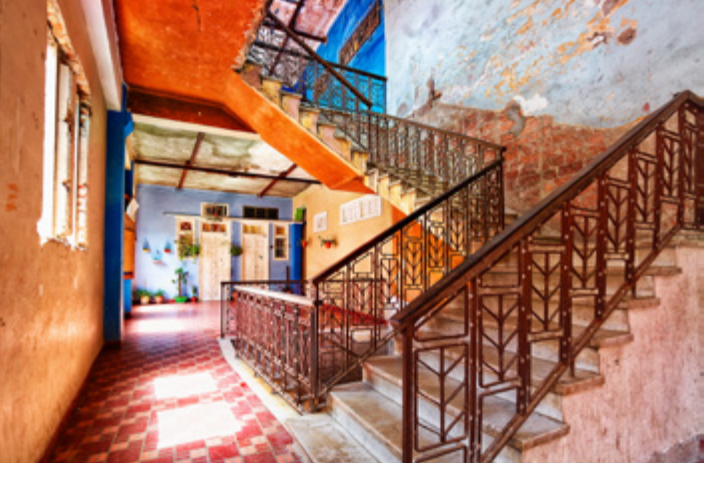
Paseo del Prado, Havana