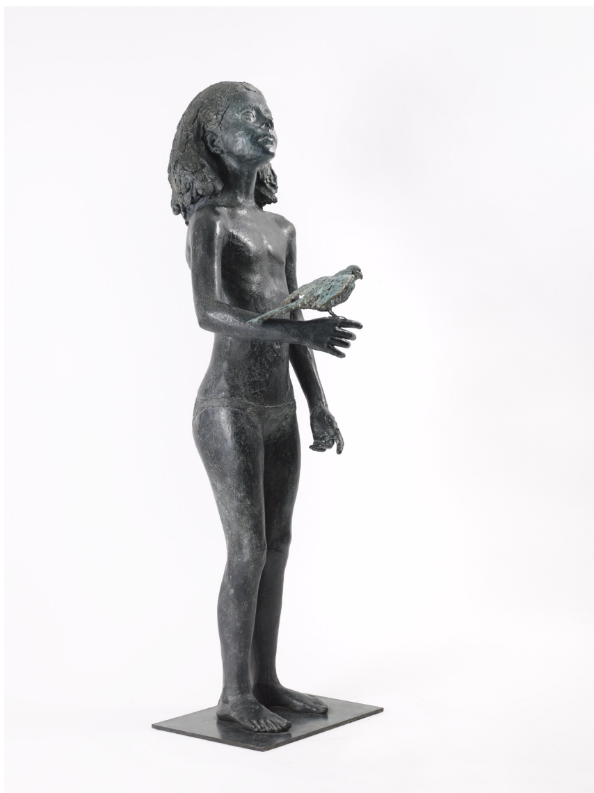
CHARLOTTE CHAMPION Josephine et l'Oiseau , 2016 Bronze Exemplaire N° 1/8 Signé et numéroté INV Nbr. chac_067