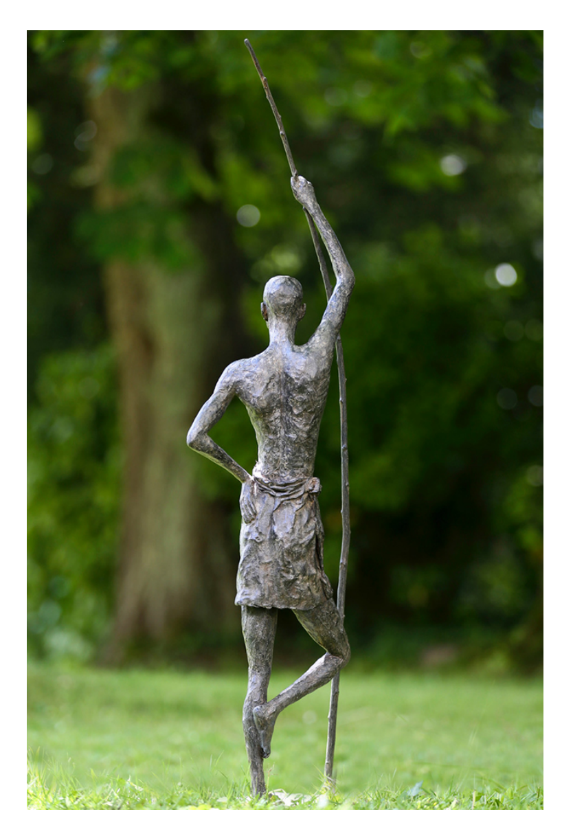
MARINE DE SOOS Entre ciel et terre Bronze 57 x 13 x 16 in (146 x 33 x 41 cm) Exemplaire N° 4/8 Signé et numéroté INV Nbr. desm_119D