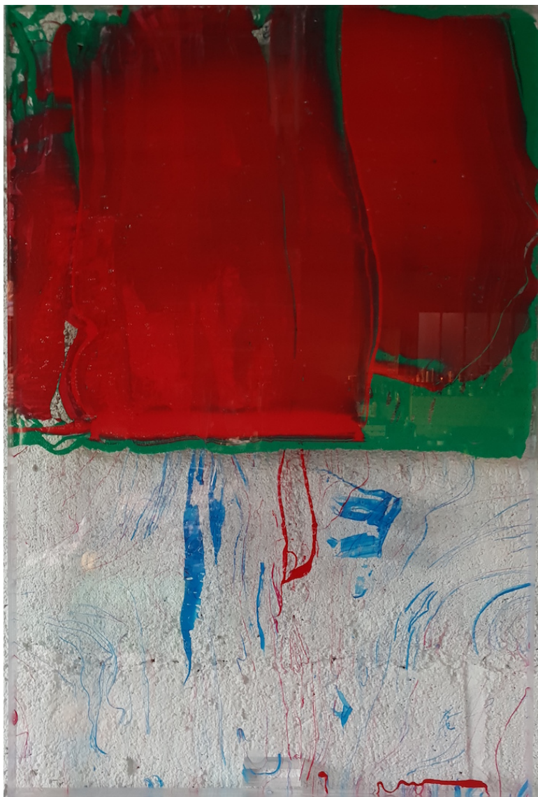
PARK BYUNG-HOON Transparence 164342-1, 2019 Acrylic on acrylic plate 24 x 16 in (60 x 40 cm) Unique artwork INV Nbr. byup_069