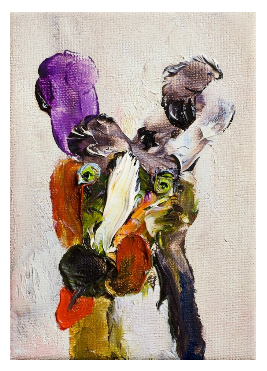
PETER KEIZER Untitled XXXV, 2015 Alles goat over alles Oil on canvas 5 x 7 in (14 x 18 cm) Unique artwork Signé INV Nbr. keip_413