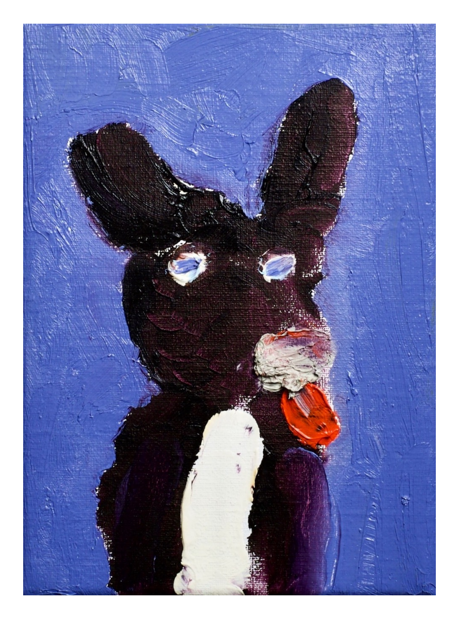
PETER KEIZER Untitled XXVII, 2015 Alles goat over alles Oil on canvas 5 x 7 in (14 x 18 cm) Unique artwork Signé INV Nbr. keip_405